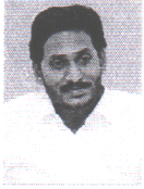
Sri Y. S. Jagan Mohan Reddy Hon'ble Chief Minister Andhra Pradesh